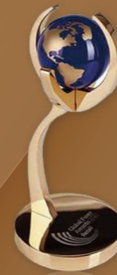
Best Forex Fintech Broker

IEXS has continuously received recognition and awards from authoritative institutions, highlighting the company's strengths in fund security, business foundation, and trading services, as well as reflecting the company's customer-centered service philosophy. The award mainly recognizes the best-performing brokers globally and regionally, rewarding companies that provide top-notch trading technology, low-cost trading, comprehensive market research tools, advanced education programs, and world-class customer service to investors or traders.